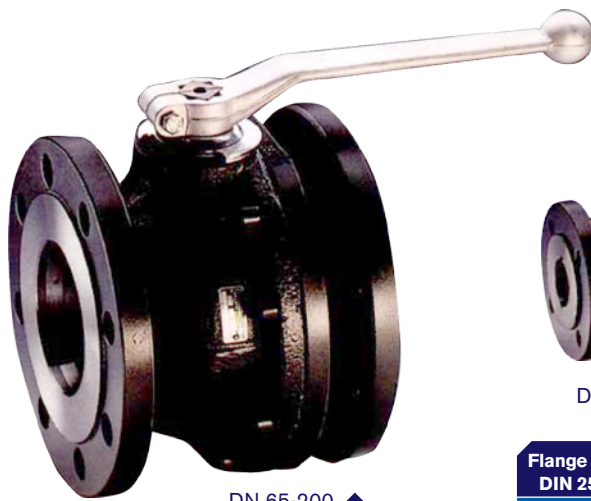
DN 65-200 ▲